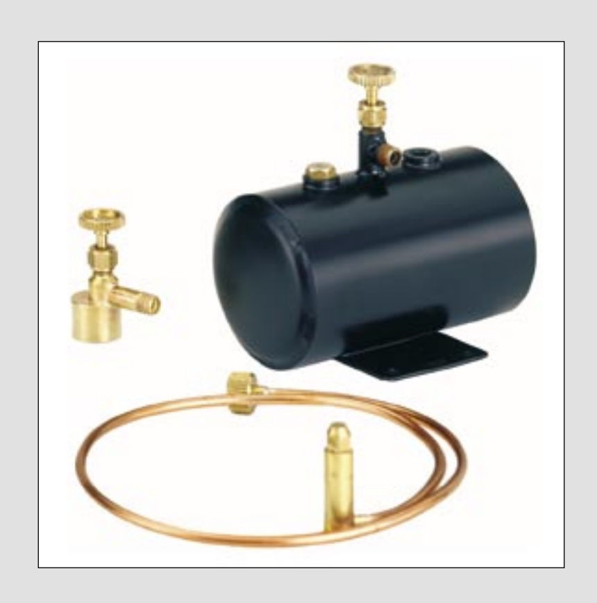
Gas Supply & Burners